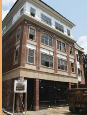
DuBois Bookstore will return to its expanded space in the Fall with student apartments above.