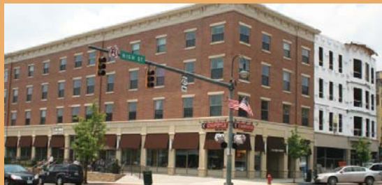
The former site of Wendy's Restaurant is now the home to the popular Chipotle's Restaurant and student apartments.