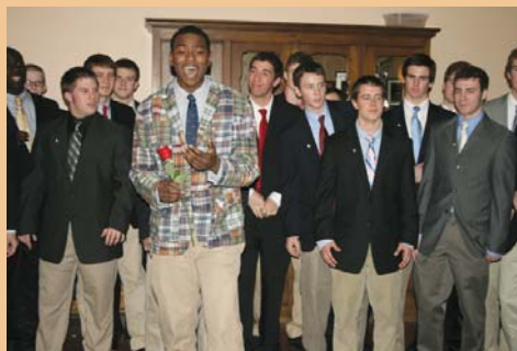
Our singing tradition lives on as requests for serenades from our pledges poured in throughout Spring semester.