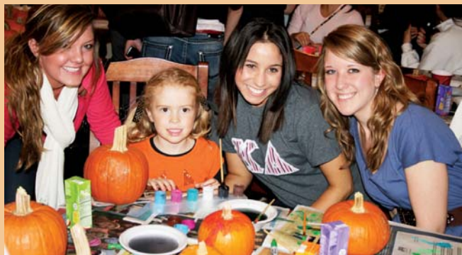
Children of campus faculty and staff enjoyed participating in our second annual Halloween Pumpkin Party sponsored in conjunction with Phi Mu, Kappa Delta and Alpha Phi Alpha.

O ne of the great benefits Beta is able to provide its undergraduates are the exceptional leadership experiences offered each year. The leadership programs range from building leadership skills for those just initiated to leadership 'fine-tuning' for those about to enter alumni status. As a second-year student, I am privileged to have all of these great opportunities available to me. Last summer, I participated in two leadership programs: the Nellie & John Wooden Institute for Men of Principle and the Leadership College at the General Fraternity Convention in Washington, D.C.