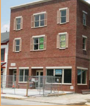
Calista Tower has replaced The Balcony, Ozgies/High Street Grill

There's been a lot of building going on in Oxford in recent times. Many of the one-story buildings have been demolished as four-story buildings take their places with commercial space on the ground-floor and student housing on floors 2-4. These photos are just a few of the projects underway, or recently completed.