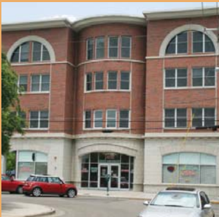
On the former site of Pedro's