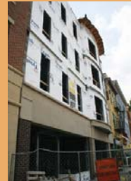
The former site of Burger King